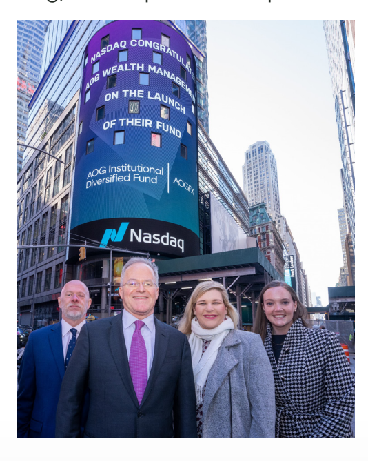
The AOG Wealth Management team celebrated the fund's one year anniversary with a warm welcome from Nasdaq<sup>1</sup> to Times Square.

Institutional investors have long favored private fund investing, known also as alternative investing, in their pursuit of superior returns.